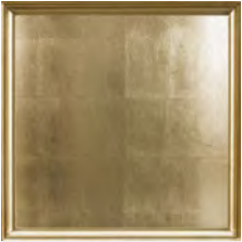
GS: Gold Leaf Squares Painstakingly applied by hand in a grid pattern with very subtle black highlighting.