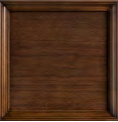
P3: Smoked Walnut (L) Natural clarity of the wood is enhanced with a darkened stain.