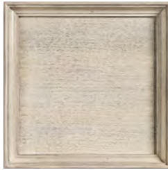
M1: Mushroom (L) A light grey-beige base opaque paint accented with a hand applied dark grey dry brush in a linear pattern similar to a natural grain pattern.