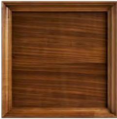
NT: Natural Walnut (L) A clear stain on walnut allowing the natural color variation of the dark and light walnut grain to show through. *ONLY AVAILABLE ON WALNUT VENEER.