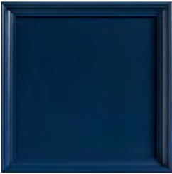
NP: Navy (L) A deep rich classic blue opaque paint.