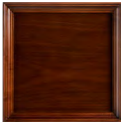
55: Soho (M) A rich, medium-value, clear brown finish reminiscent of a lightly burnished antique wood.