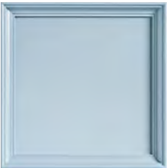
BP: Sky (L) A soft tranquil light blue opaque paint reminiscent of a spring or summer cloudless sky.