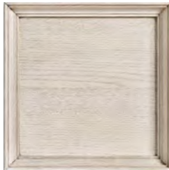
P6: Sandstone P6 (L) Sandstone is a casual lighter hue with a whitewashed canvas effect. The depth of the finish is subtle and crafted with character.