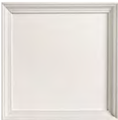
28: Sugar (L) An opaque, clean white finish with a very slight intermittent rub-through along the perimeter edge.