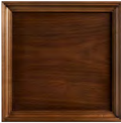
M2: Carob Brown (L) A low sheen and warm brown finish enhances Walnut's beautiful grain and warm tonal ranges.