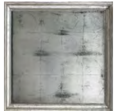
ML: Black Pearl Silver leaf squares that are heavily worn-through, over top of a high gloss black paint background.