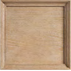
J3: Washed Canvas (L)* Has a white filler intended to hang up in the grain, then sealed, dry-brushed, visually distressed, and finished with three coats of lacquer. *AVAILABLE ON ASH & OAK ITEMS ONLY.