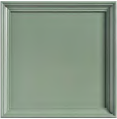
GP: Sage (L) A soothing, earthy green-grey opaque paint.