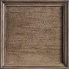
N4: Vintage Grey (L)** Casual semi-opaque grey finish with grain character highlighted through sandblasting. **AVAILABLE ON ASH & OAK SANDBLASTED ITEMS ONLY.