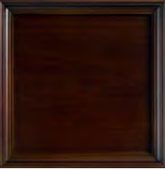
30: Walnut (M) A sophisticated walnut brown with russet undertones enhancing the natural beauty of wood.