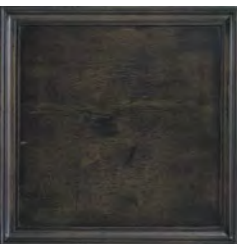
C3: Malabar (M) A wonderfully soft black finish with brown undertones.