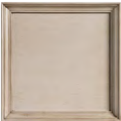
B2: Fog Grey (L) An opaque grey paint with a light taupe surface spatter providing a more casual and slightly aged appearance.