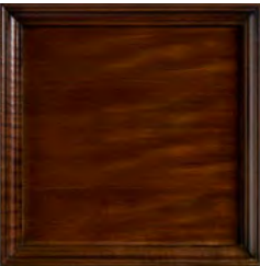
G1: Cotswold (M) A deep clear brown finish with a medium-high sheen level is apt for a formal traditional or urban high-end contemporary look.