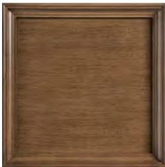
G4: Greystone (L) A warm putty stain enhanced with a light umber dry brush that gives the finish a slight two -tone effect.