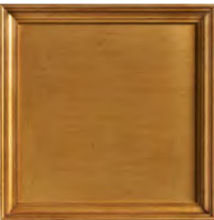
F4: Gold (L) Gold paint with a glazed appearance to emulate the beauty and appearance of gold leafing.