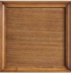
C4: Cashew (L) Mid-toned brown stain that allows the natural color variation of the wood to show through.