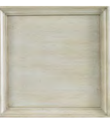
H2: Sancere (L) A warm, creamy ivory painted finish with a very light brush-stroke glaze applied over the top.