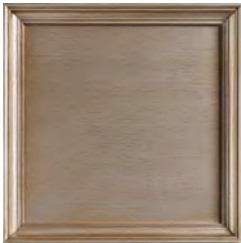
M5: Silver Fox (H) Metallic silver color that is very refined, allowing for translucence to showcase the natural beauty of the wood.