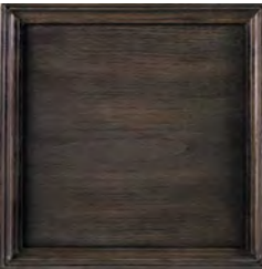
J8: Cinder (L) A clear medium-brown finish with hints of dusky grey beneath the surface provides an almost iridescent effect.