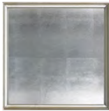
SS: Silver Leaf Squares Painstakingly applied by hand in a grid pattern with very subtle black highlighting.