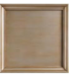
87: Platinum (L) Platinum is a metallic finish with an underlying base of silver and subtle hand-padded gold overtones, giving a platinum patina.