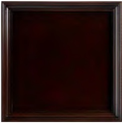
C8: Café Noir (M) The color of rich, dark Colombian coffee. A beautifully sleek, dark brown/black finish.