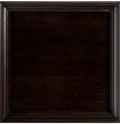
G3: Ore (L) A dark rich brown stain that allows the grain of the wood to show but equalizes the color variation of the dark and light wood for a more uniform color.