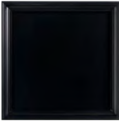
K2: Black (L) A rich and true black finish with a deep luster.