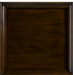
A2: Modern Elm A2 (M) Developed to take advantage of elm veneer grain patterns, this warm greyish-brown high sheen creates a soft, transitional look.