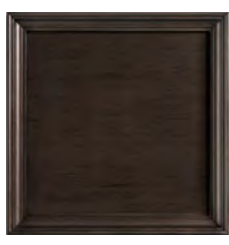
39: Black Nickel (H) A deep nickel-colored paint finish with very fine black brushing on top and a high sheen to resemble black nickel metal.