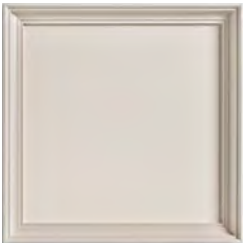
WP: Cotton (L) A pleasing, opaque soft white paint.