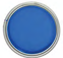
CM: Color Match (M) Select any brand name paint color, and we will Color Match it on your order; include name, number, and color chip with the order.