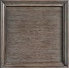
G2: Steel (L) A medium "battleship grey" wood stain that allows the beauty of the grain to show but equalizes the color variation of the dark and light wood for a more uniform finish.