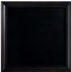
20: Ebony (M) A rich rubbed-through black finish that highlights the underlying wood tones with a lustrous satin-like patina.