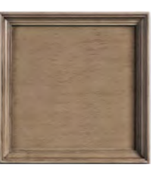
J5: Slate (L) A multi-step finish starting with a medium brown finish, then overlaid with a grey-beige secondary finish.