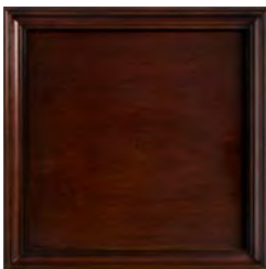
07: Maison (M) A rich, hand-rubbed waxed dark walnut finish enhanced with hand-burnished edges, cow tailing, and a light antique spatter.