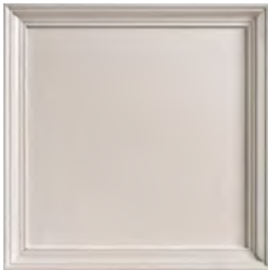
Y1: Cultured Pearl (H) An opaque, pearlesized white finish with a slight iridescent shine similar to a natural cultured pearl.