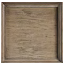
J7: Mineral (L) Grey-stained finish with some translucence which accentuates the wood character of the item.