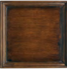
LC: Antique Walnut (M) A rich, clear, and dark brown finish with reddish undertones reminiscent of the color of a dark acorn.