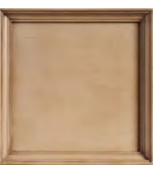
17: Dove (L) A soft patinated Belgian grey finish, burnished and detailed with a gently spattered antique glaze.