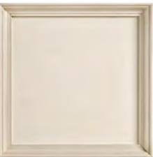
34: Washed Linen (L) Clean, off-white finish with a very light rub through, providing the natural look of washed cotton or flax.