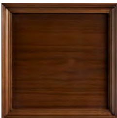
A1: Modern Walnut (M) A rich, warm brown finish that emphasizes the clarity and natural beauty of the wood.