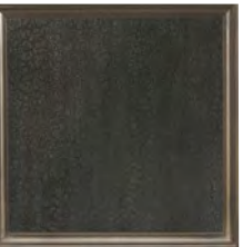
BZ: Bronze Patina Bronze Patina is an organic, variegated finish comprised of browns and grays reflecting an acid-washed surface.