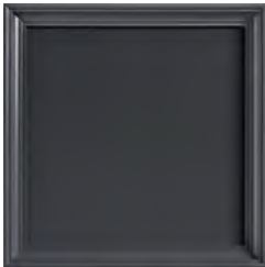
CP: Coal (L) An opaque grey finish that is perfect for a formal traditional, or urban high-end contemporary look.