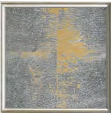
SG: Silver Leaf with Gold Created by applying gold painted ground color, hand-applying silver leaf sheets in a grid pattern, then wearing the edges.